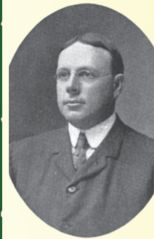
George R. Carter Territorial Governor Founder of HMMH Archives