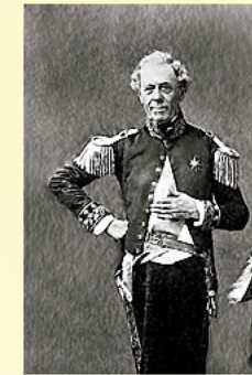
Robert C. Wyllie Minister of Foreign Affairs Founder of Kingdom Archives